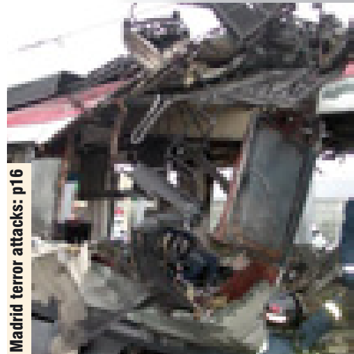
Madrid terror attacks: p16