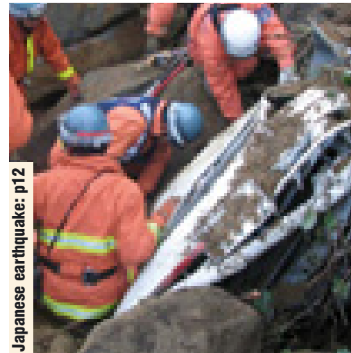
Japanese earthquake: p12