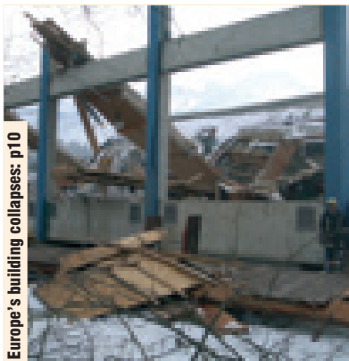
Europe's building collapses: p10

Disaster co-ordination in France 34 France's 'defence zone' system, is designed to deal with non-military defence, civil protection, crisis management, RTA co-ordination and special police unit despatch, says Colonel François Maurer