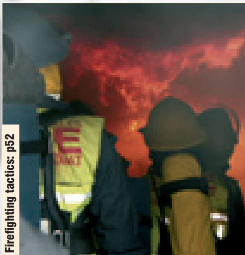
Firefighting tactics: p52