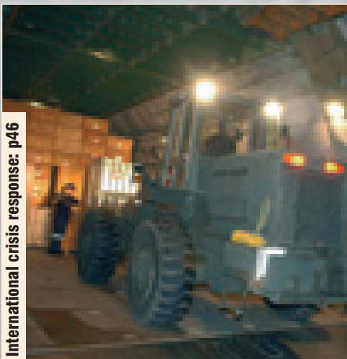
International crisis response: p46