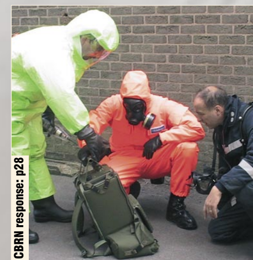
CBRN response: p28