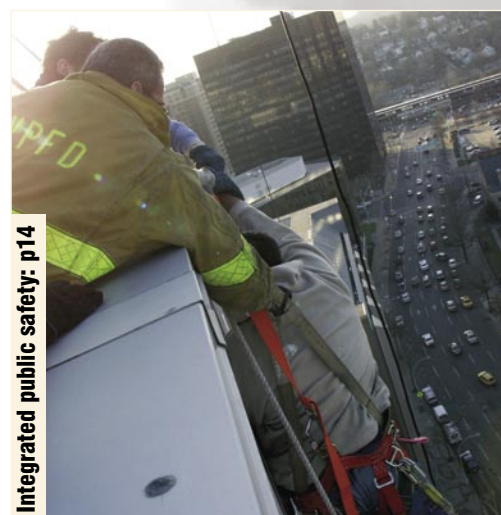
Integrated public safety: p14