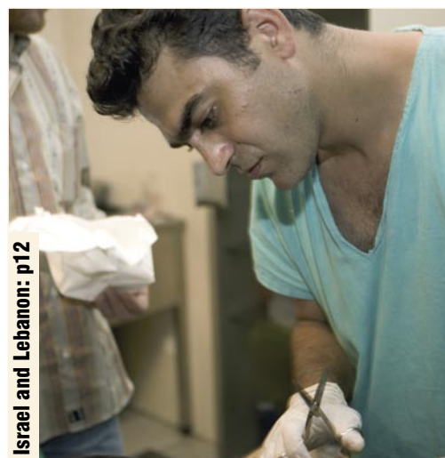
Israel and Lebanon: p12