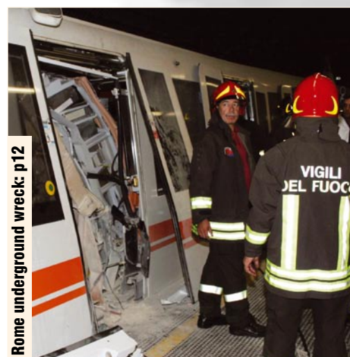
Rome underground wreck: p12