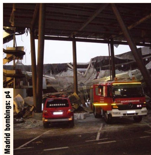
Madrid bombings: p4