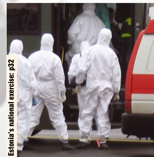
Estonia's national exercise: p32