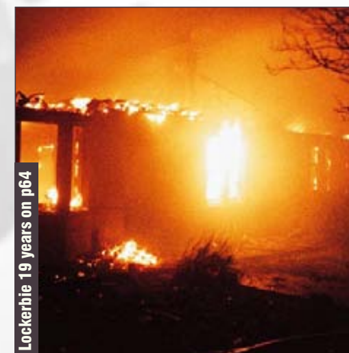
Lockerbie 19 years on p64