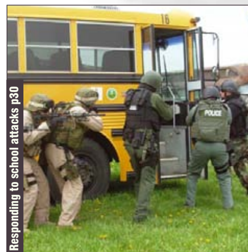
Responding to school attacks p30