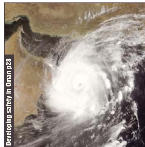
Developing safety in Oman p28