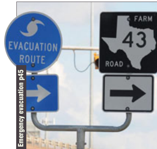
Emergency evacuation p45