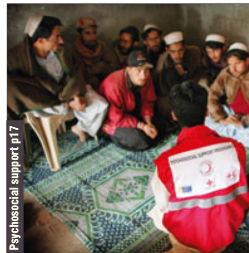
Psychosocial support p17