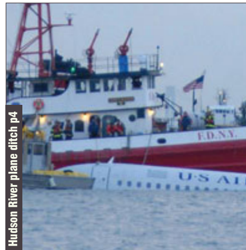
Hudson River plane ditch p4